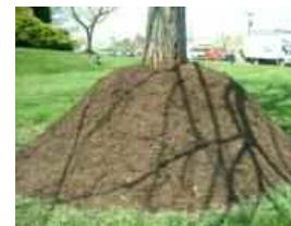
Volcano mulching suffocates surface roots of trees.