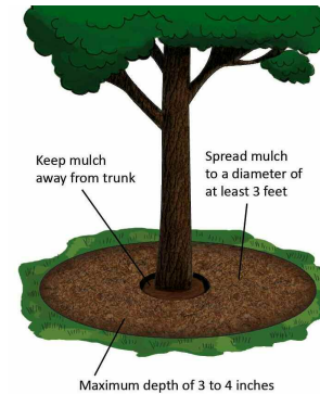
Proper mulching can help keep a tree healthy.

May: Replace some turf with mulched beds, a rain garden, or pocket meadow