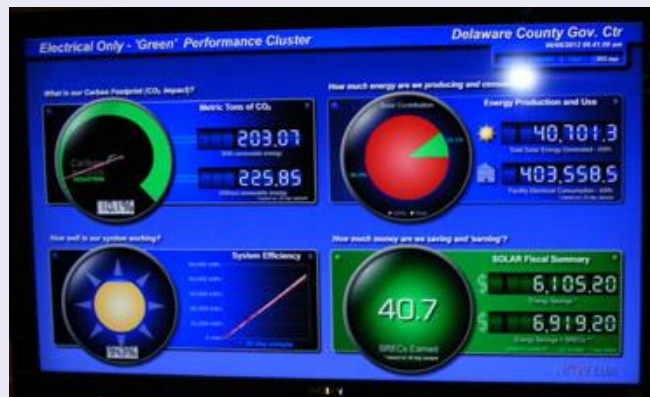
Figure 4: Screen shot of the solar power graphic panel at the Delaware County Government Services Center

Monitoring and displaying total solar electricity generation can be very beneficial to verify the performance of the solar PV systems installed in Media, track savings, and motivate support for solar. It will also provide the community an interactive way to understand the benefits of Media Borough's solar power leadership. By tying the nine solar systems into a shared web-based visualization tool like the one in place at the County's Government Center (Figure 4), the Borough can further increase awareness of the panels and create momentum toward a cleaner energy future.